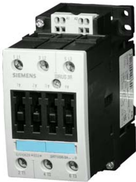
CONTACTOR, AC-3 15 KW/400 V, AC 230 V, 50 HZ, 3-POLE, SIZE S2, CAGE CLAMP