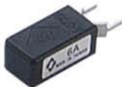
4A-9A 10A(A-0705X ONLY)