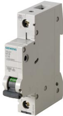
Miniature circuit breaker 230/400 V 6kA, 1-pole, C, 6A