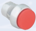
Push Button, Non-illuminated, Momentary, Extended