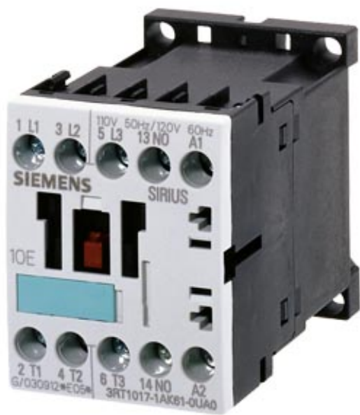
CONTACTOR, AC-3 5,5 KW/400 V, 1 NO AC 110 V 50 HZ/120 V 60 HZ 3-POLE, SIZE S00, SCREW CONNECTION