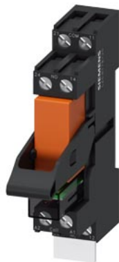
Plug-in relay complete unit 2 W, 230 V AC LED module red Standard plug-in socket screw terminal