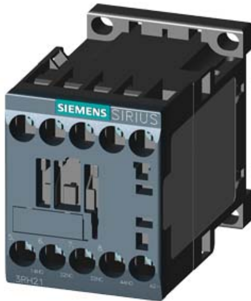
CONTACTOR RELAY, 2NO+2NC, DC 24V, SIZE S00, SCREW TERMINAL