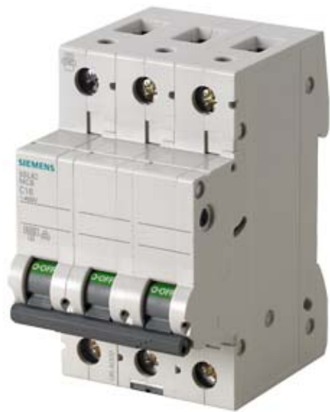
Similar to image