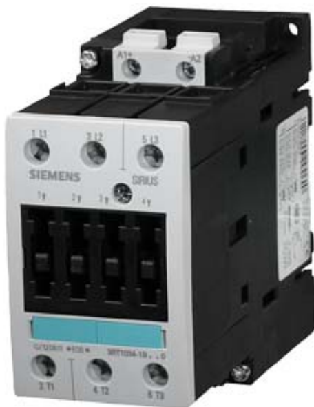
CONTACTOR, AC-3 15 KW/400 V, DC 24 V, 3-POLE, SIZE S2, SCREW CONNECTION