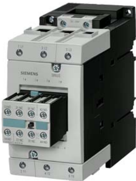
CONTACTOR, AC-3 30 KW/400 V, AC 230 V, 50 HZ, 2 NO + 2 NC 3-POLE, SIZE S3, SCREW CONNECTION